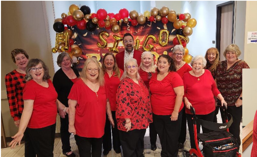
November Singo Bingo