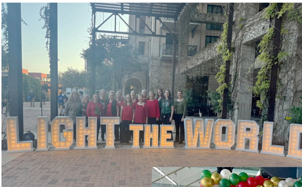
The Giving Machine performance