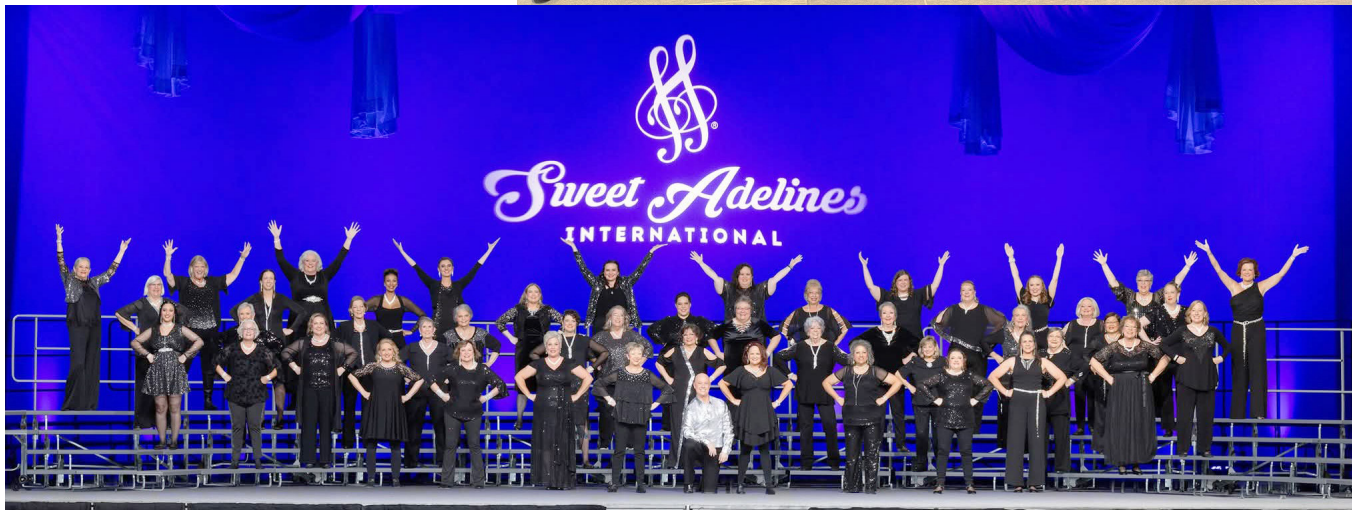
AMC 13th place at SAI International