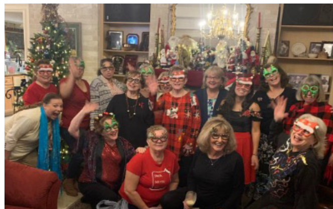
Annual Christmas Party - time to relax and have a few laughs

Party. We had so much fun playing new hilarious games which included song title games, singing and being merry.