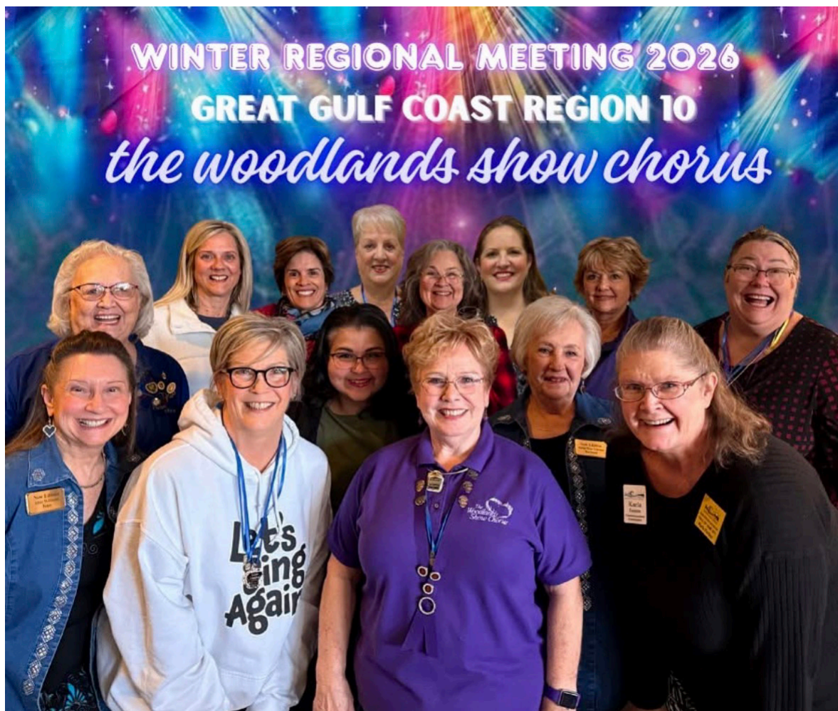
TWSC representatives at Region Winter Workshop in Austin.