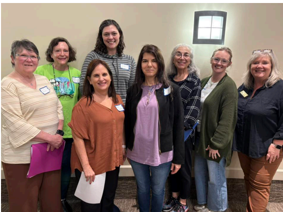
At a recent guest night, we welcomed seven guests!

We will be ready for contest in April and can't wait to be together again with our Region10 friends!