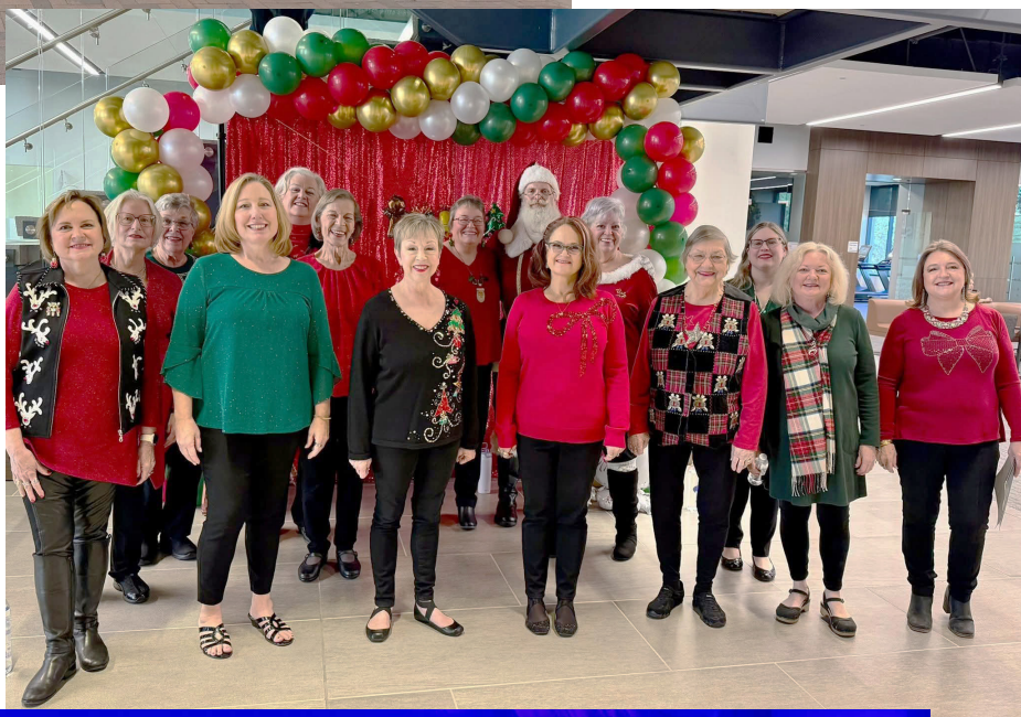
WellMed Christmas luncheon