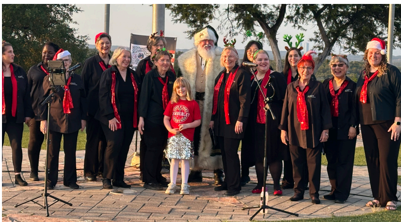
Opening night at Wimberley Trail of Lights