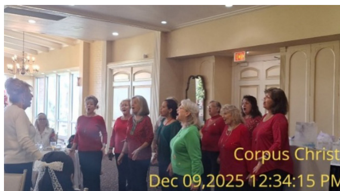
Entertaining at the luncheon for the Christus Spohn Volunteers

“Angels we have heard on high” Our special venue was singing for the Christus Spohn Volunteers Luncheon at the Corpus Christi Country Club where we continued spreading the Christmas Spirit..