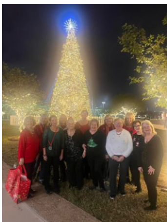
Lighting of the Christmas Tree in Portland

“O Christmas tree Oh Christmas tree” what a fabulous time we had singing at the Lighting of the Christmas Tree at Portland’s Coastal Christmas Event caroling throughout their entire winter wonderland. Perfect weather and lots of Christmas joy to be in the midst of the children, families and the community.