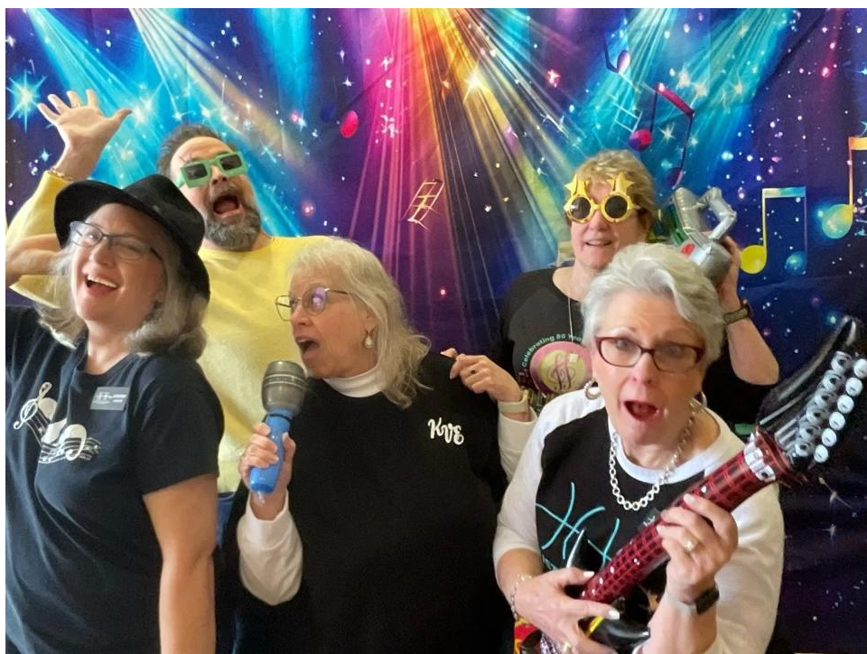
KVE at Winter Workshop in Austin