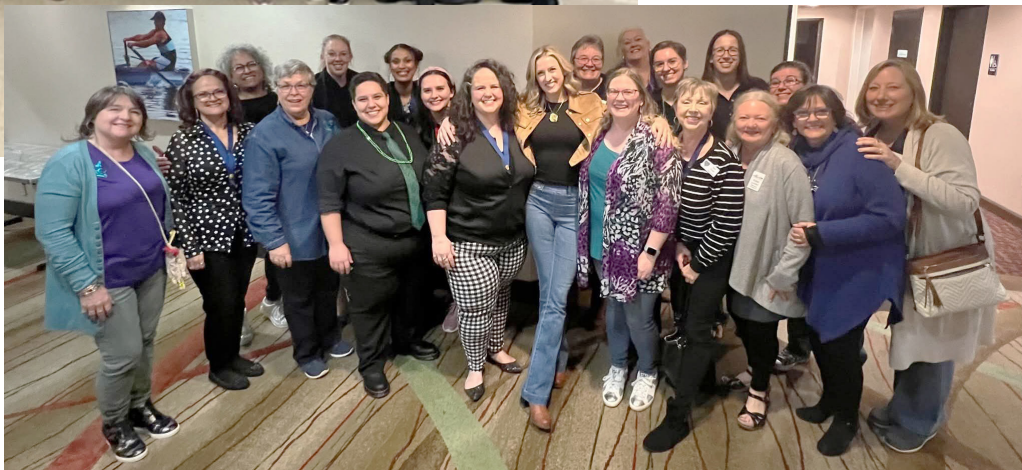
(Right) AMC members attending the Region's Winter Workshop in Austin.