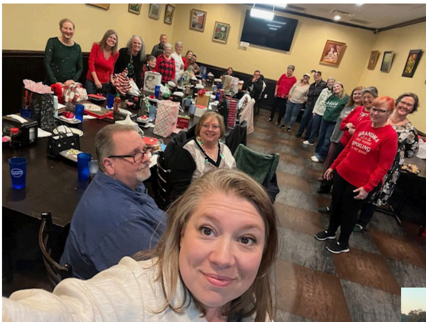
Group at Genesis UMC, and Note-ably North Texas's Cookies, Cocoa, and Christmas Show—talented singers with impressive baking skills! We closed out 2025 with a joyful Christmas party and are excitedly looking ahead to 2026's Winter Workshop, Singing Valentines, and contest season.

These fall performances led us into our holiday concert, Christmas Chaos . We were joined by wonderful quartets, including our own Vocal Velvet and Vintage Quartet, along with Texas Tradition Chorus and students from Southwest Christian School. Their participation was a beautiful reminder of how music connects generations.