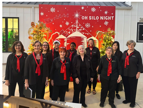
Buda "Oh Silo Nights"