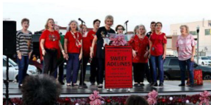
Warming up our instruments prior to the Lighting of Peppermint Lane in the evening.

"Walking in a winter wonderland" It was a thrill to sing at the Lighting of Peppermint Lane where all could stroll with friends and family and be dazzled with the Christmas songs and lights.