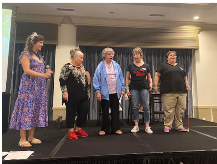
LSC members at the Jurassic Chords event