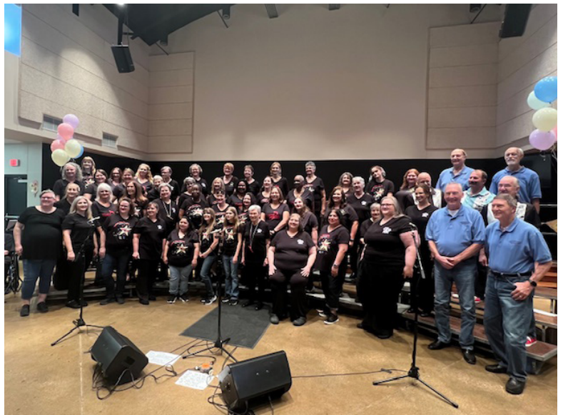
Lone Star and Notably North Texas perform together at the Ice Cream Social