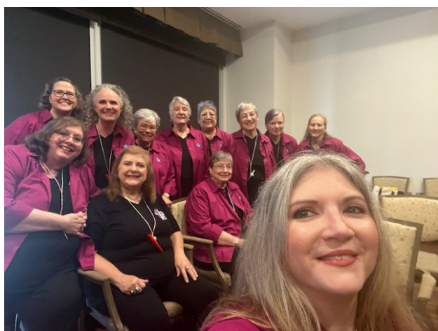
Lone Star at Trinity Terrace