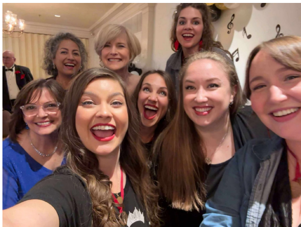
Hot Note and The Ladies