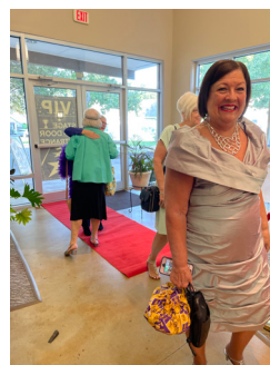
(Clockwise) Broadway Barbershop, Guests arriving on the red carpet, Guest night guest