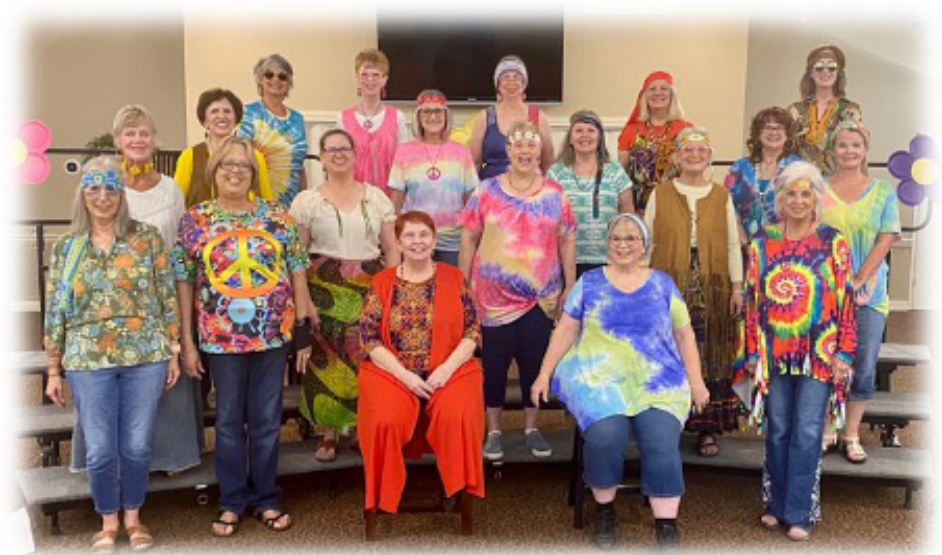
A Cappella 101 community performers