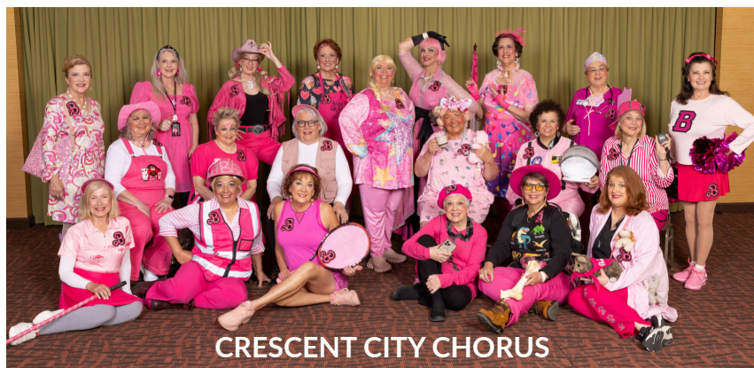
CRESCENT CITY CHORUS