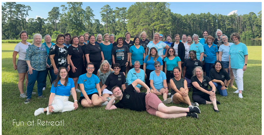
Fun at Retreat!