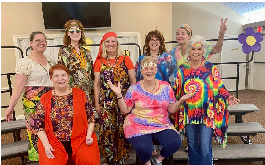
A Cappella 101 Friends & Family night

We are now busy preparing for our fall show, FEELIN' GROOVY. Special guest chorus is the Tyler, TX group East Texas Men in Harmony . The show is November 1 at the North Street Church of Christ in Nacogdoches.