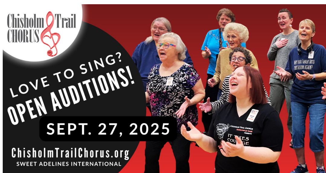
Advertisement for our Open Auditions. There was an accompanying "Register" button to take viewers to our website with details.