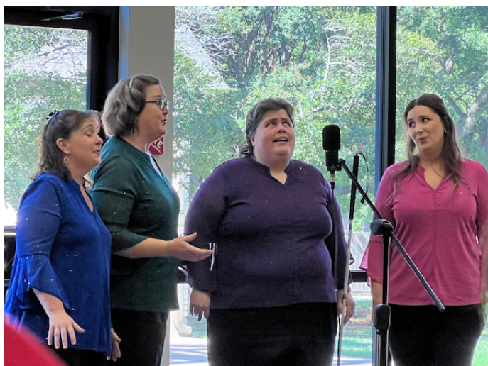
Vocal Velvet at Novice Quartet Contest