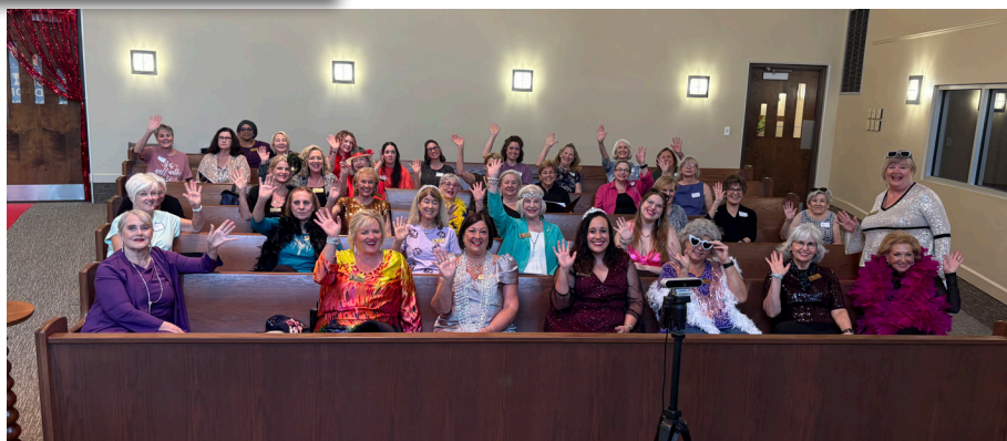
Sixteen guests at Broadway Opening Night