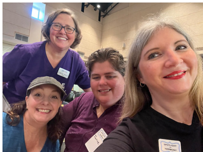
Lone Star members at Spotlight on Harmony