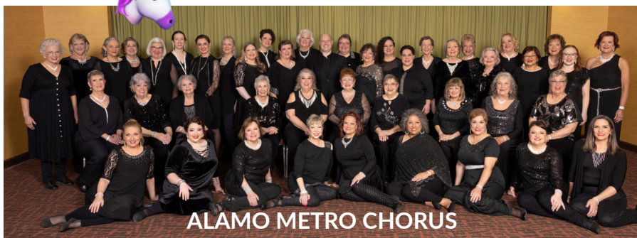
ALAMO METRO CHORUS