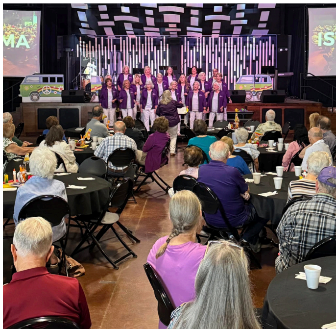
"New Adventure Trip" at Istrouma Baptist Seniors luncheon.