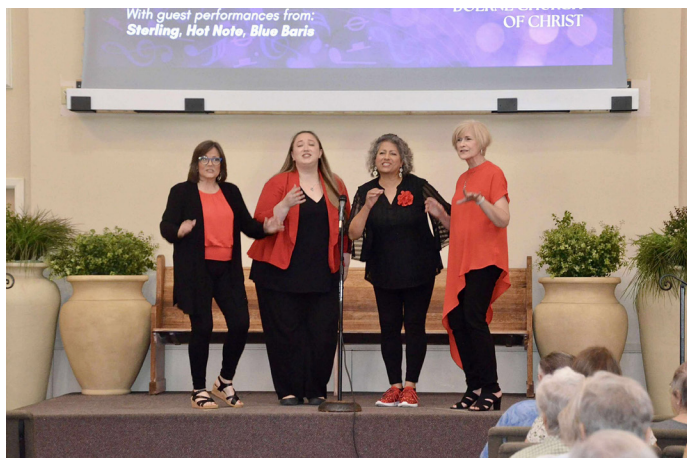
Hot Note at benefit concert in Boerne