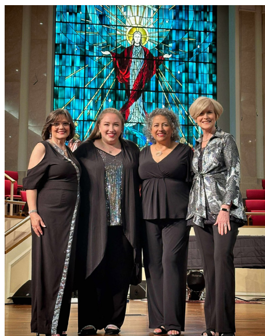
Hot Note in the sanctuary of the beautiful Trinity Baptist Church, San Antonio, where the Harmony Belles Fall Spectacular was held

Submitted by Hot Note Quartet cssbebe@gmail.com