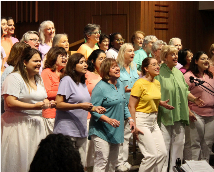
Pics from our summer show

We beat the heat with sweet treats and sweeter harmonies at One of Those Songs , our Ice Cream Social Summer Show on July 27! Our audience enjoyed our chill tunes, and the guest appearances from Mixfits and Essence! Between the music, festive decorations, and sweet ice cream treats, the day was a perfect blend of joy and community spirit. We're thrilled to share some photos from the day and can't wait to celebrate National Ice Cream Day again next year.