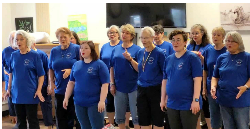
Chisholm Trail sings at a Labor Day weekend party in Hamilton, TX