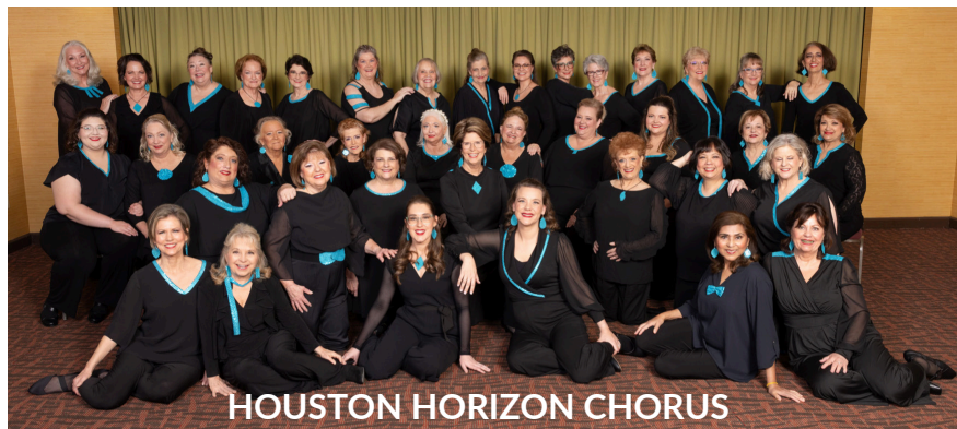
HOUSTON HORIZON CHORUS