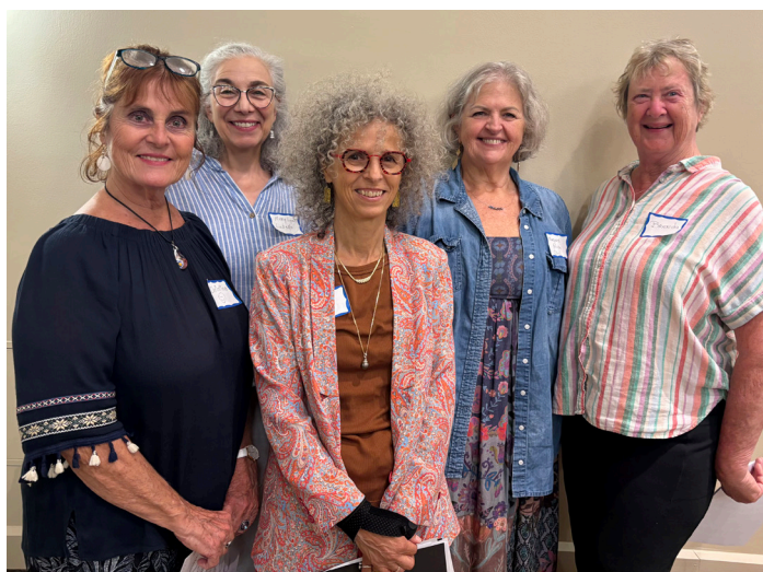
OLLI Class Members