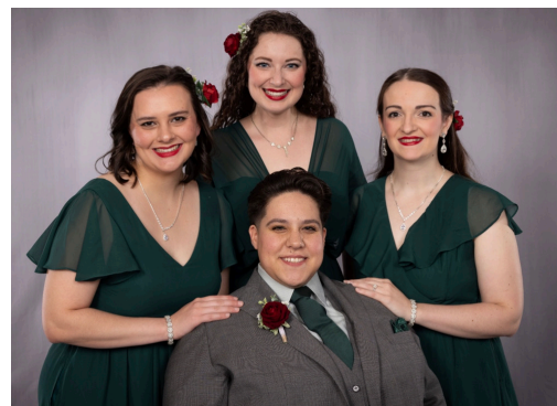
SAVING GRACE QUARTET