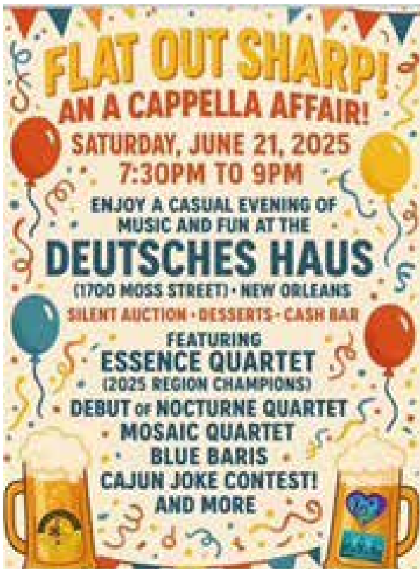
Supporting our sisters in song