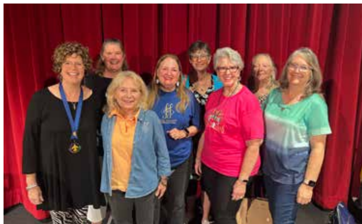
HHC Members had fun at Summer Splash!

We had a small yet powerful group of HHC members journey to New Orleans recently for the Great Gulf Coast Region 10 Sweet Adelines Summer Splash Workshop. What an incredible weekend it was! Connecting with friends from other choruses and learning from outstanding coaches is always a great experience.