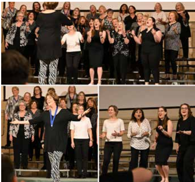
National Barbershop Quartet Day.

We thoroughly enjoyed performing at the National Barbershop Quartet Day combined show on April 11, alongside our sibling choruses and quartets from Houston! We had two chapter quartets performing: Mama Made Me Duet and Texas Transplants . The barbershop scene in Houston is thriving!