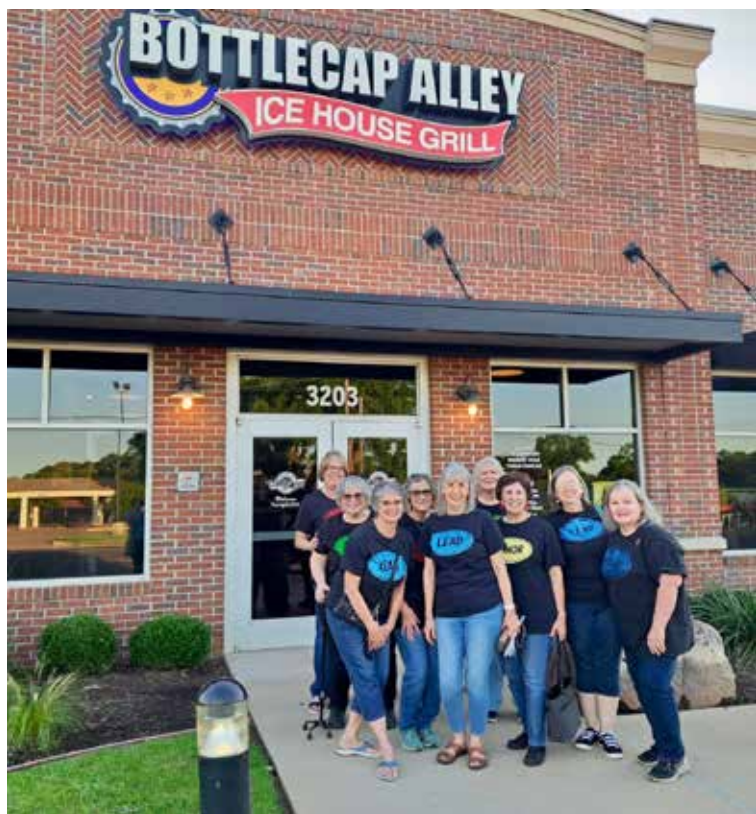
Sing-out in the community at Bottlecap Alley