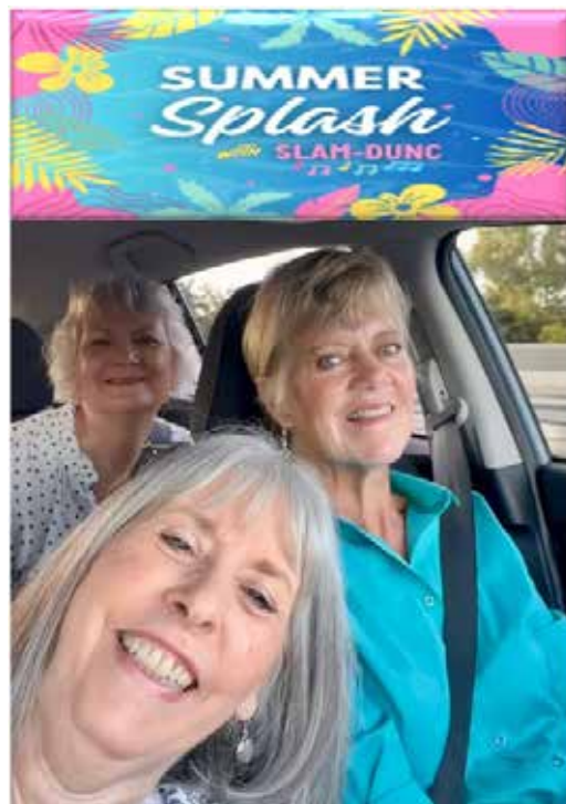
Summer Splash in NOLA