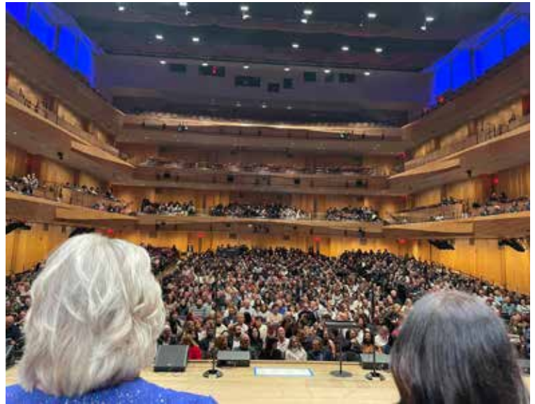
Lincoln Center Audience