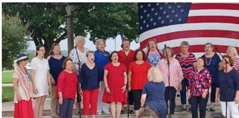
Memorial Day Performance at Fort Sam Houston Cemetery