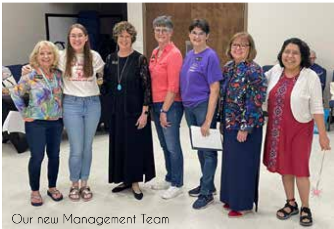
Our new Management Team