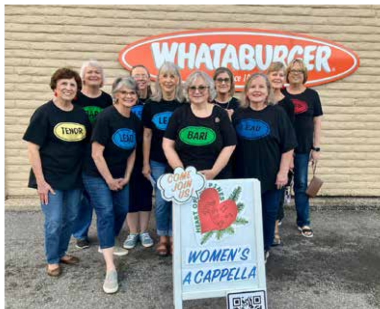
Sing-out in the community at Whataburger