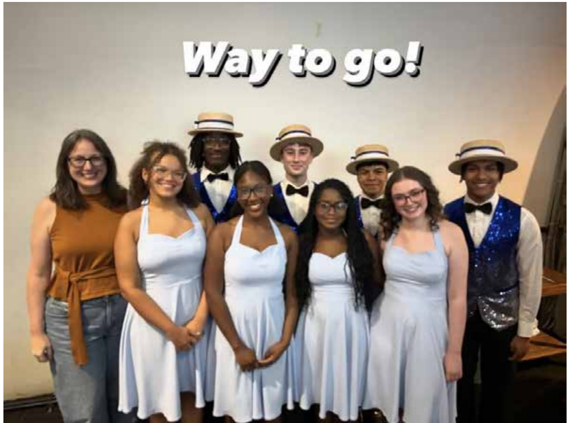
Decibelles & Bell Tones from LD Bell High School,