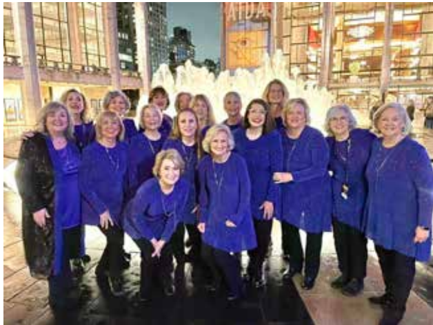
Lincoln Center Fountain