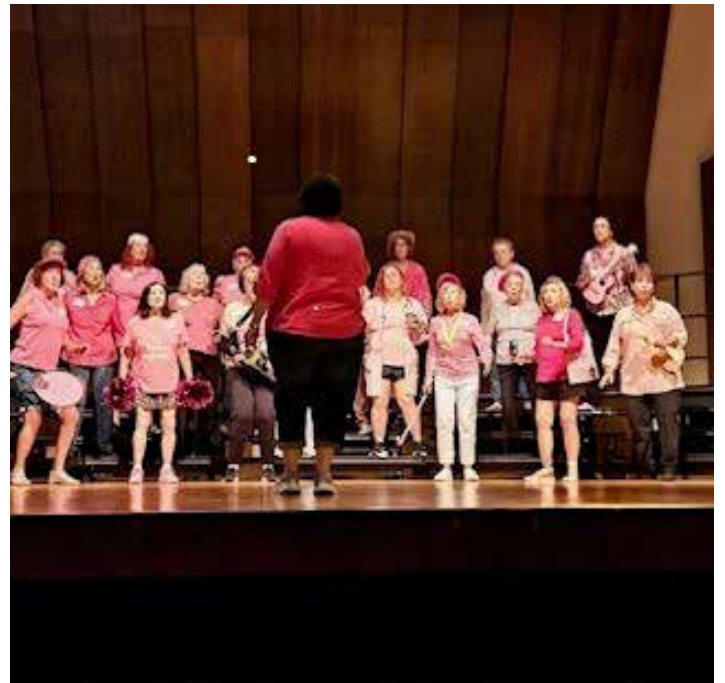
Previewing our Harmony Classic set for the Region