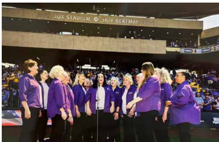
Baton Rouge performs the National Anthem for LSU vs Arkansas baseball game.