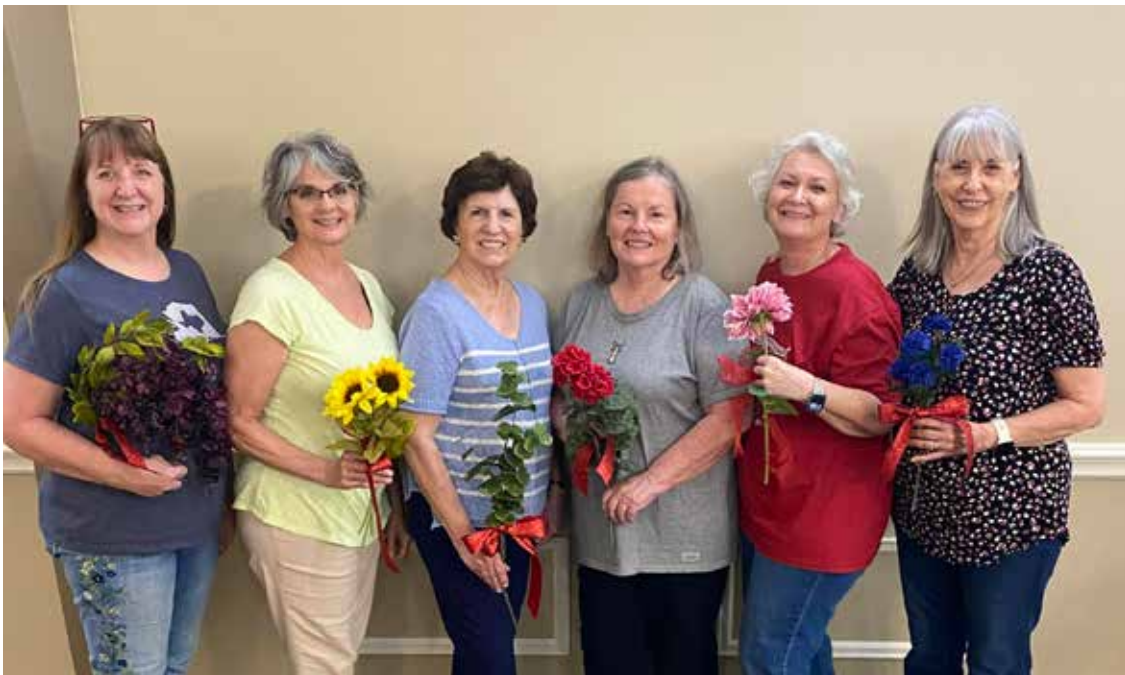
HOTP 2025 Management Team

Three chorus members attended the fantastic Summer Splash in New Orleans. Grunge is now our friend and we are excited to put it to the test with the chorus.