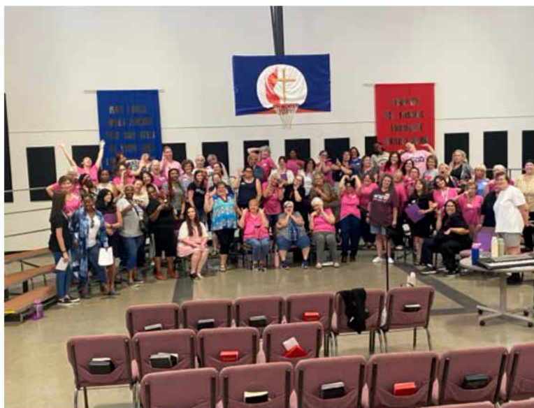
Our first Summer Series rehearsal