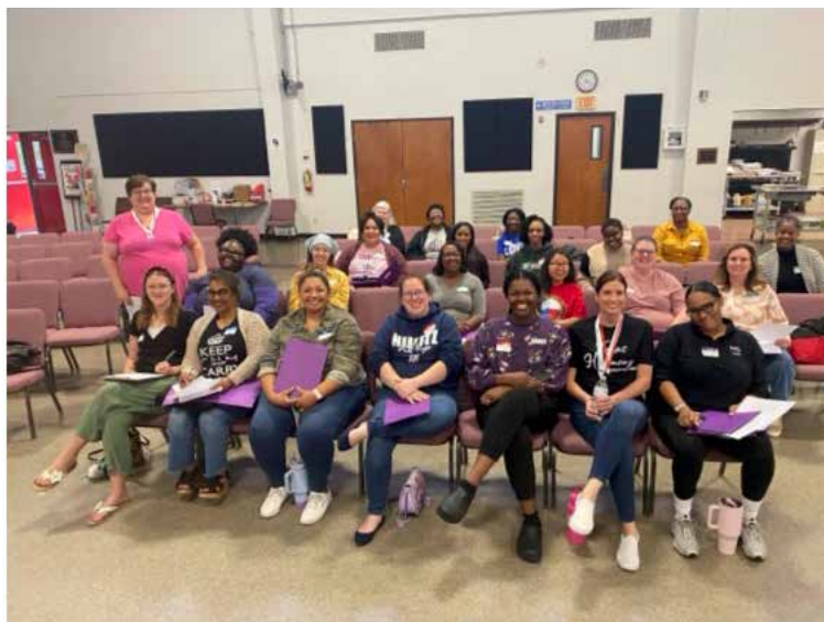
Some of the respondents to our open audition call

We held open auditions and had 54 women respond. We welcomed some fantastic, talented women to sing with us in our Annual Summer Series. During our Summer Series, we spend six weeks learning four songs and then have a show to conclude the series. This year we are learning songs by legendary divas Annie Lennox, Lady Gaga, Dolly Parton, Kelly Clarkson, and Whitney Houston. We are so excited that many of our Summer Divas have already decided to become members and join our chorus. We are looking forward to the Summer Finale on July 14th.