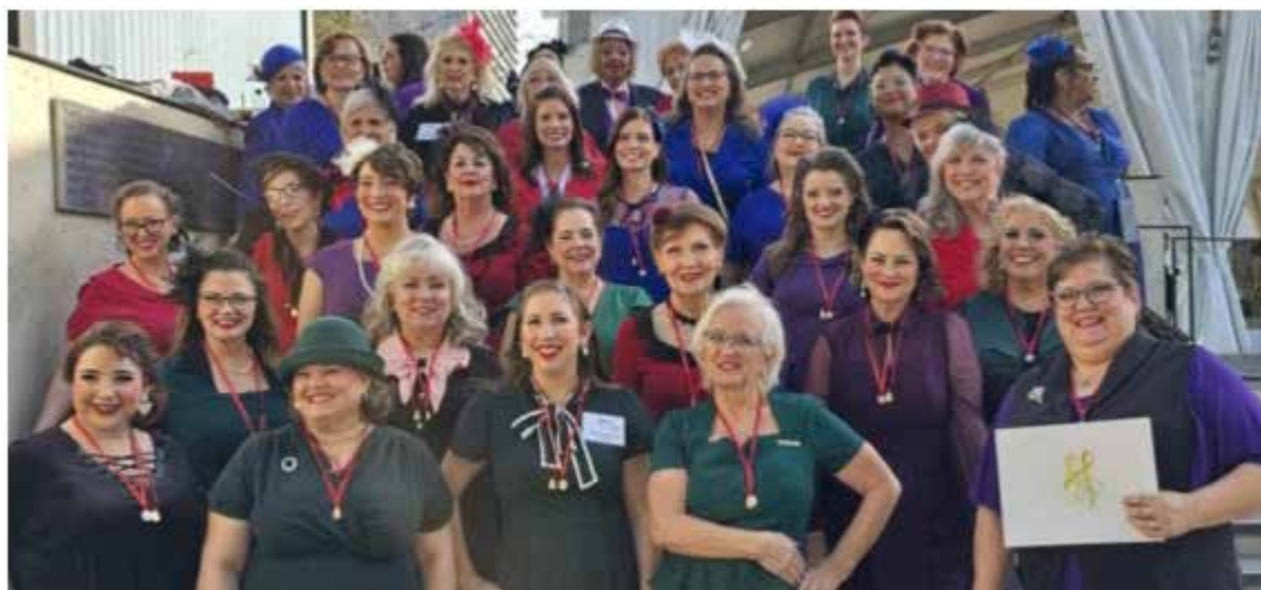
Texas Harmony and their Second Place Division AA Certificate

We are over the moon with our second place medal at Regional Competition this year. But we are just as proud of our Audience Choice Award . We had a blast singing our contest music package as women dancing at a vibrant jazz party celebrating music and social interactions, and then contemplating aloneness in the quiet still of the wee small hours.