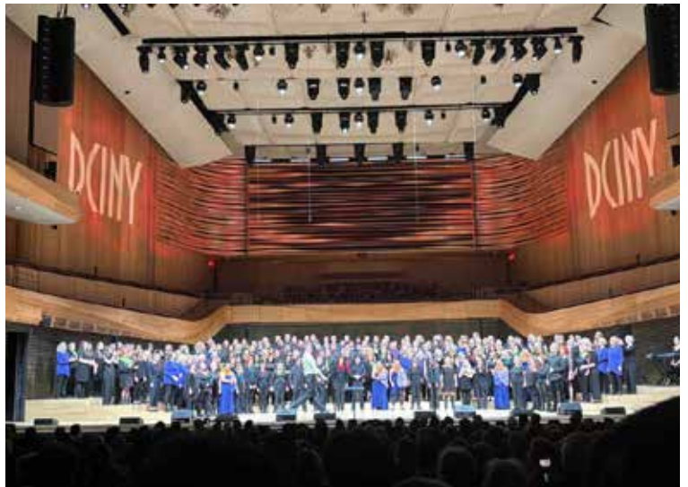
All the singers participating in the Lincoln Center concert