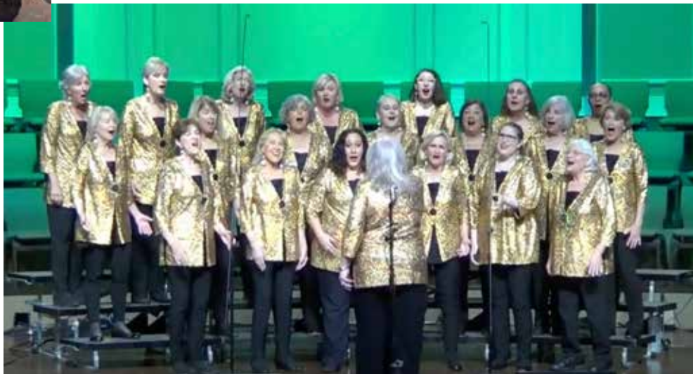
Baton Rouge on Broadway