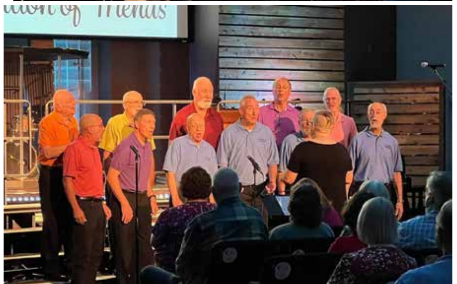
(Top to Bottom) Lone Star Chorus, Note-Ably North Texas, Southwest Sound