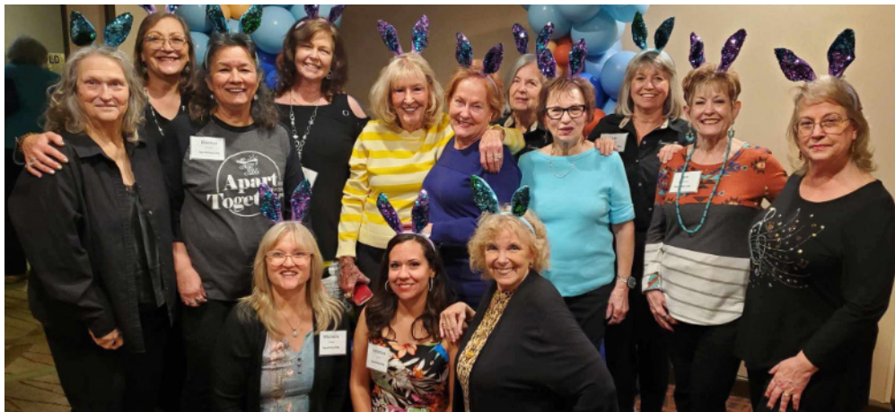
Bunnies on the move in Austin!