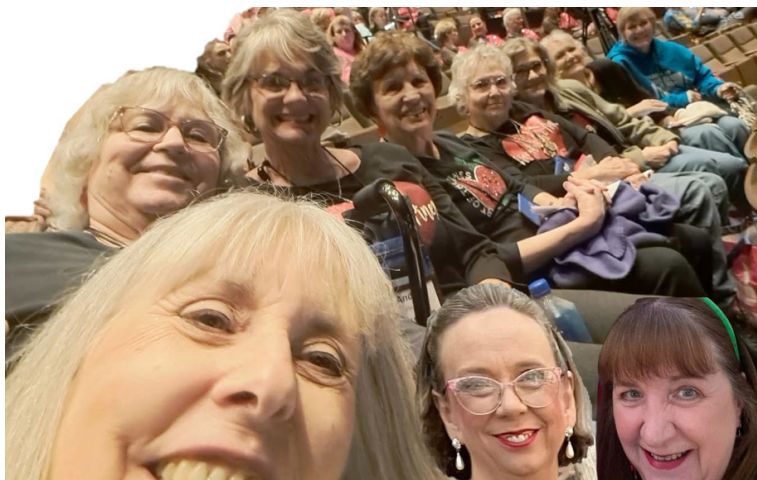
HOP in Austin supporting Region 10