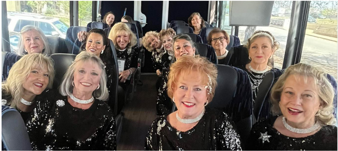
Pretty and gorgeous = Sparkling voices & sound