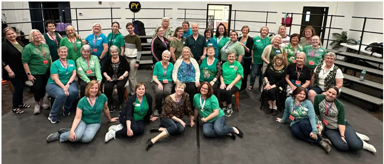
Happy St. Patrick's Day and the wearin' o' the green!

And finally, we would like to congratulate The Woodlands Show Chorus on becoming our new chorus champions! We are so proud of all our quartets who competed this year, but especially Essence Quartet, our new Regional Champions! Their performance was magical and we know they will represent our Region splendidly!!