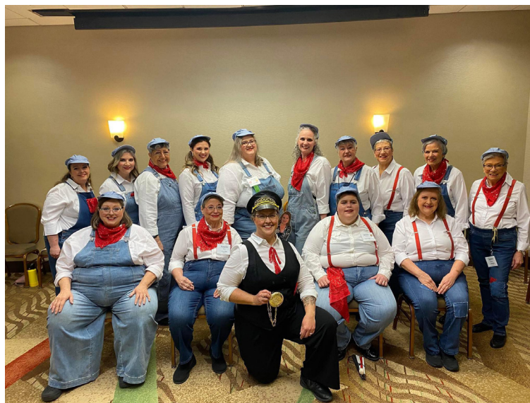
Engineering the plan