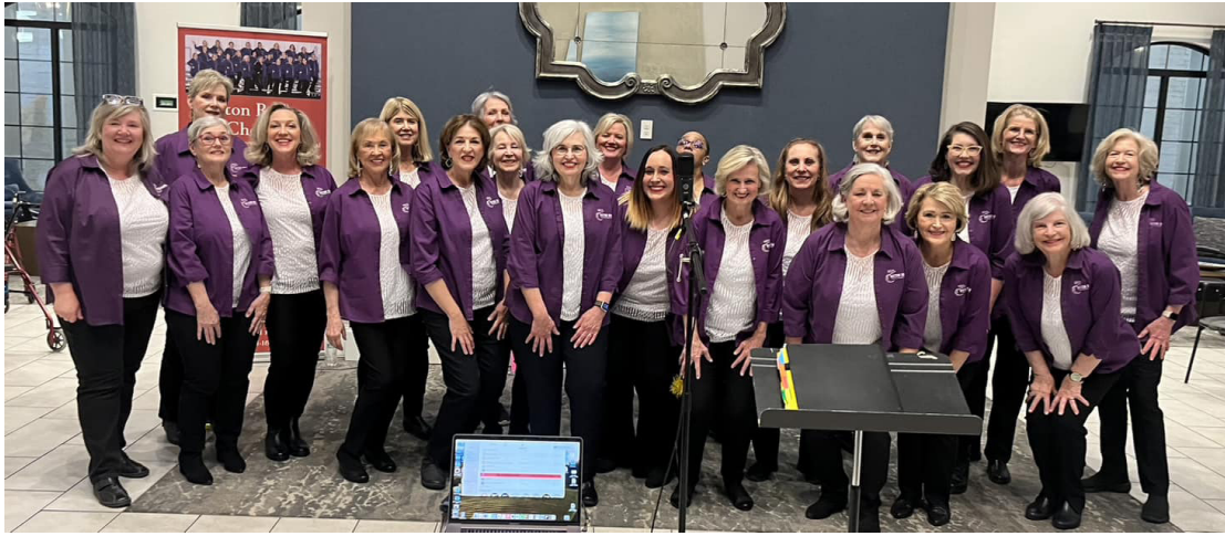
Performing for the Clairborne residents