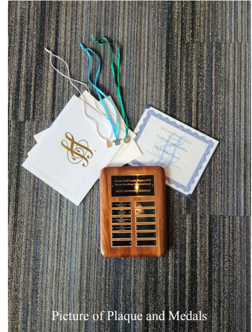
Picture of Plaque and Medals