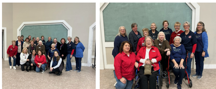
KVE members at the Winter Workshop and those who are going to Columbus with Houston in October