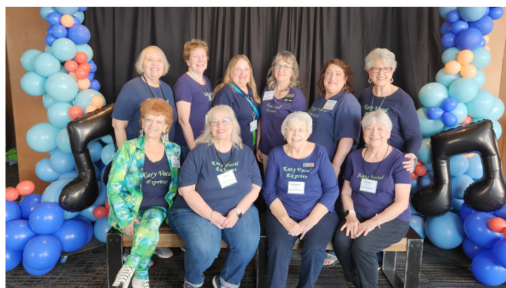
KVE at Regional Contest in Austin