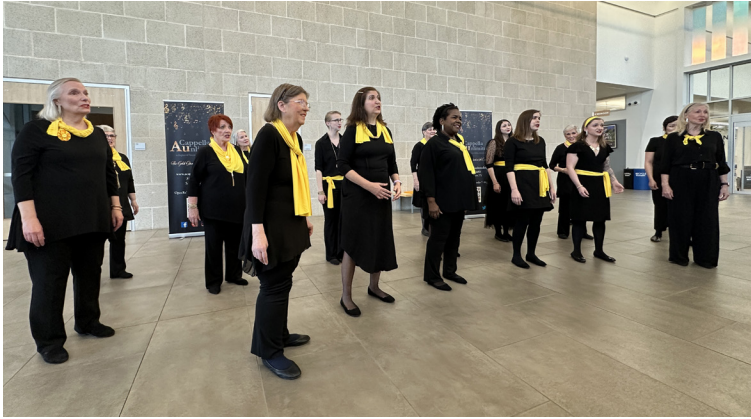
Au Send-Off Show at the San Marcos Public Library

Our director search continues with some super candidates in the pipeline. Hopefully in our next TIWT report, we'll be able to introduce the Region to a new Au director! Keeping our fingers crossed.