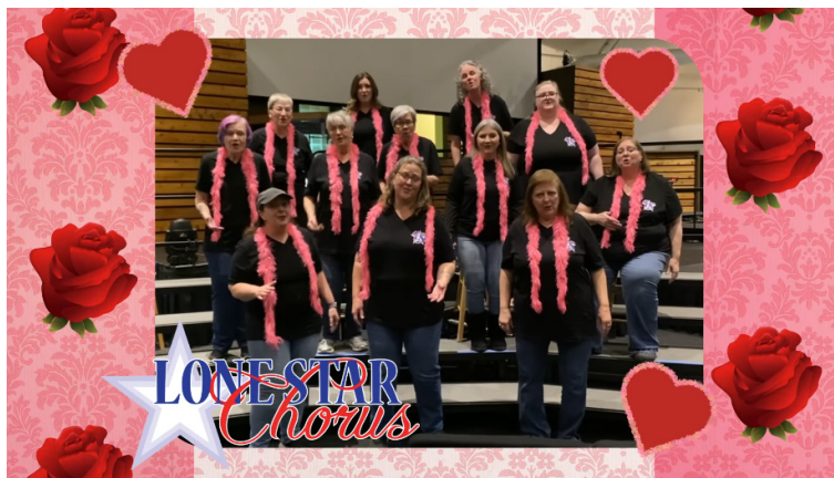
Valentines Virtual Thank You