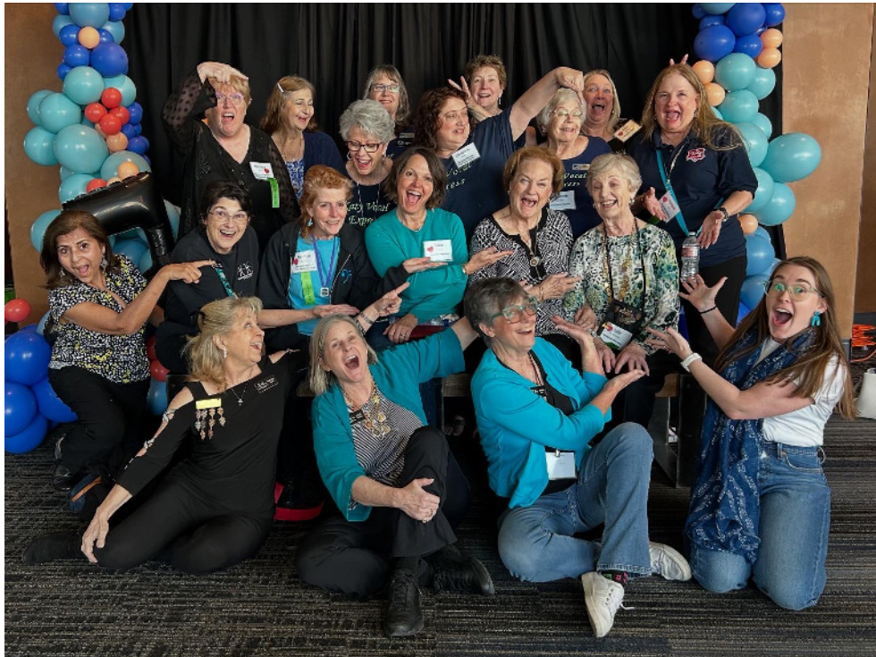
HHC having fun in Austin.