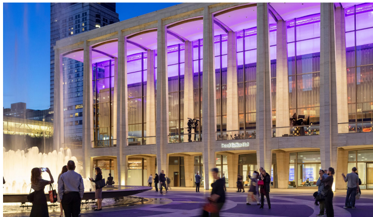
David Geffen Theatre at the Lincoln Center, New York City

Look for an update to our Lincoln Center experience in the next TIWT. We should have a lot to talk about!