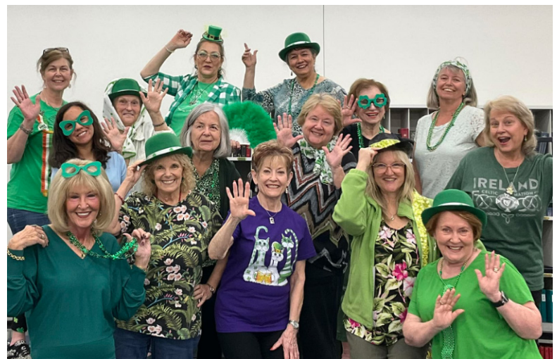
Sparkling Mardi Gras (left) and St. Patrick's Day