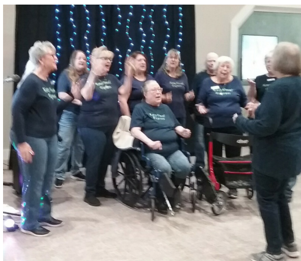
Holy Covenant fundraiser