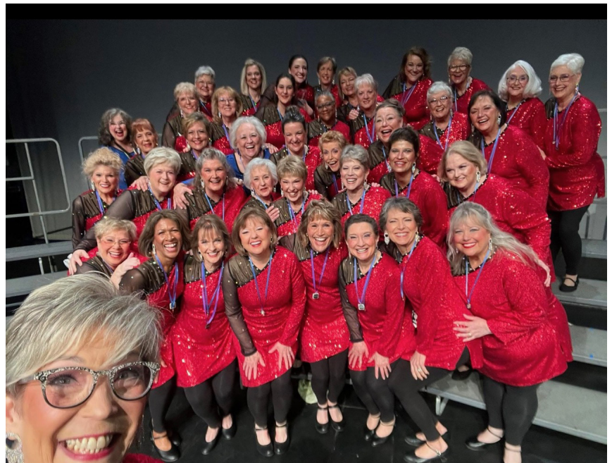
ON STAGE with TWSC at Region 10 contest! ALL Smiles!