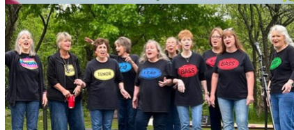
Local Spring Fling at Farmer's Market