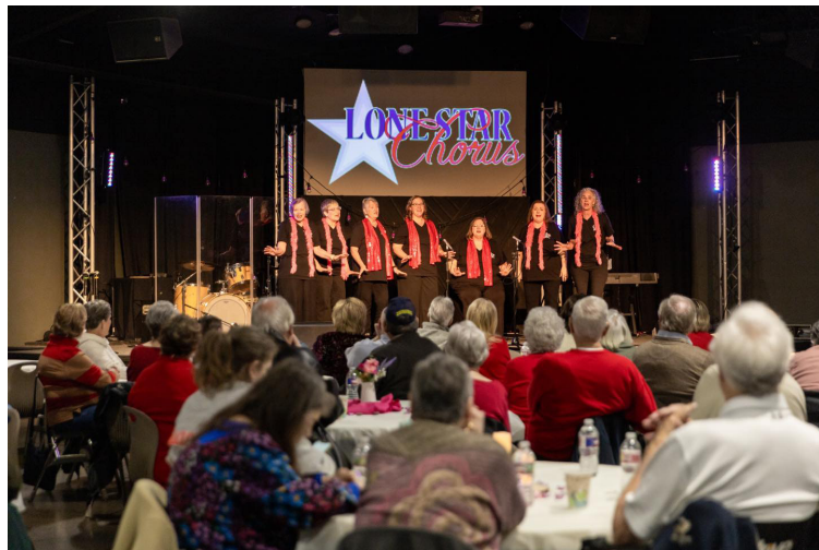
Performing at Central Bible Church

We will be spending the month of April hosting prospective members at our Sing Into Spring guest series. April also means it’s time for annual Team Elections. Lots of “barbershopping” going on!