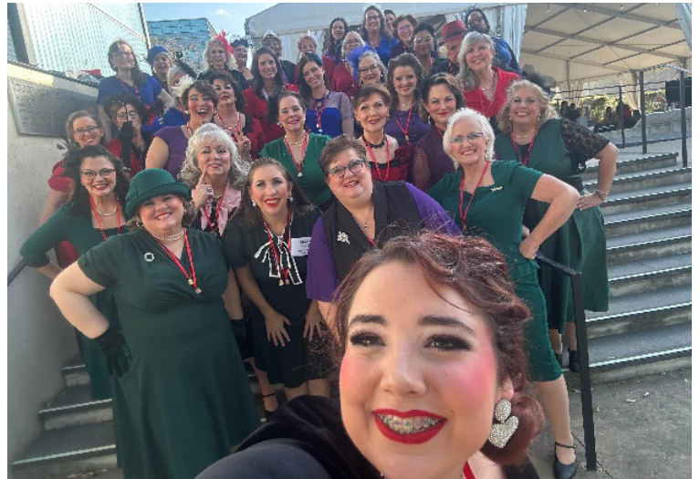
All smiles after the chorus competition