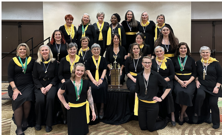
Post-competition photo with "Victoria" (the Division A First Place trophy)