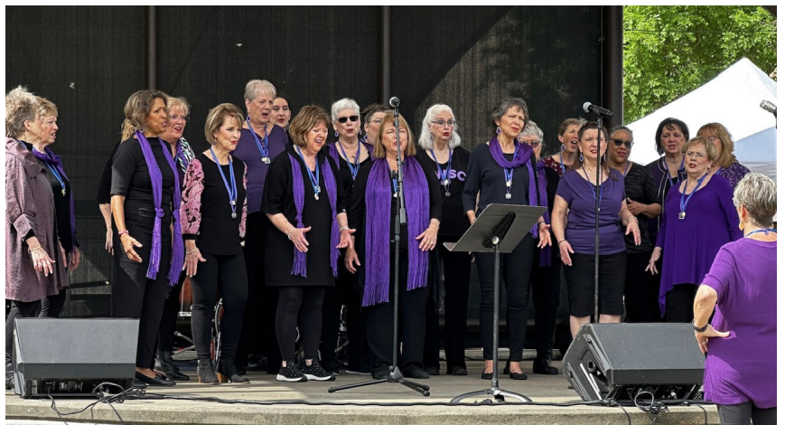
Greater Conroe Arts Alliance Festival outdoor stage area