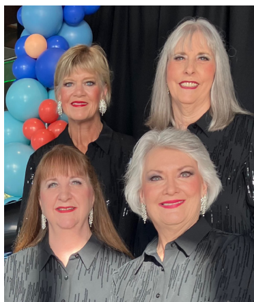
Brick Street Harmony in Austin competing for the first time