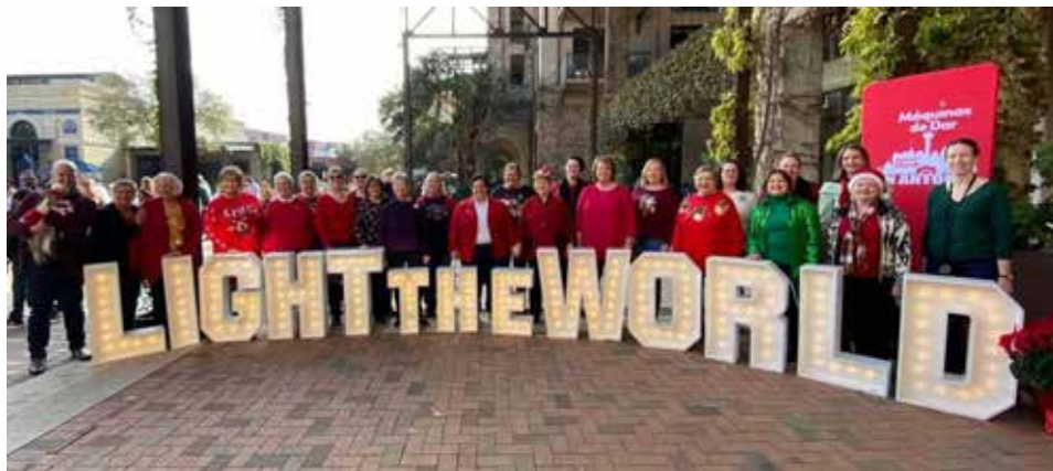
Light the World performance