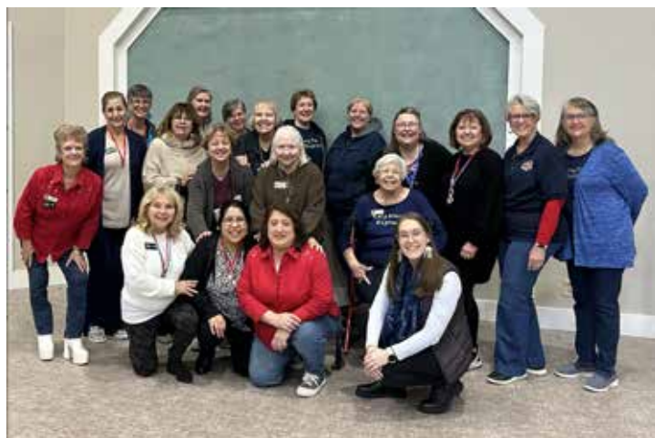
HHC represents at the Winter Workshop!

Houston Horizon Chorus had a great turnout at the Region 10 Educational Winter Workshop on January 10 and 11. Despite the cold, we braved the weather! The event was a fantastic opportunity for members to learn more about barbershop and to connect with fellow singers from across the region.