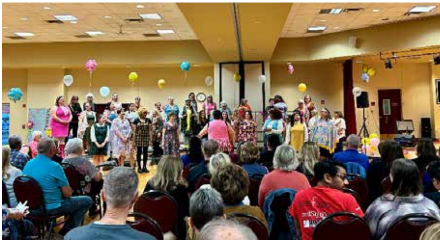
Groovin' With the Beatles 60th Anniversary show

We are looking forward to our annual retreat in February and, of course, Regional competition in March. Sending our love and hugs to our Region 10 family.