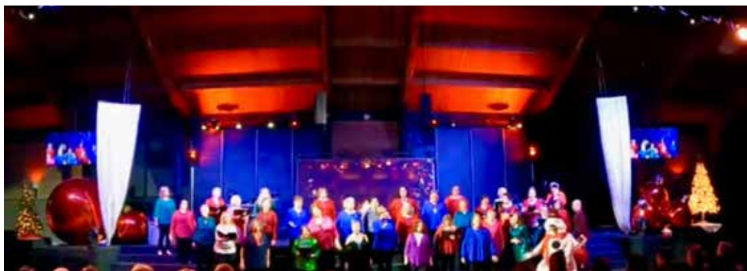
AMC Holiday Show