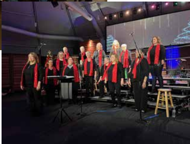
Lone Star Christmas party (top) and Christmas Show