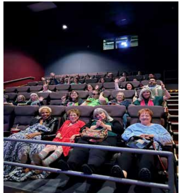
Wicked Watch Party-Yes, we sang with the movie!!