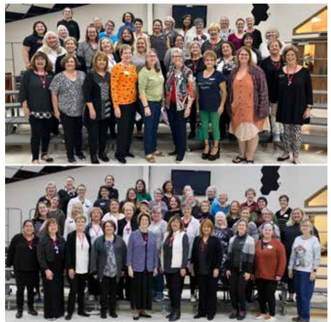
The turnout at our October and January Guest Nights!

In October, we held our inaugural Guest Night. This fun evening provided visitors with a warm introduction to barbershop and Houston Horizon, along with an opportunity for socializing afterward. Our guests had the opportunity to experience four-part harmony and join us in singing a few songs. Following the success of our October Guest Night, we organized a “New Year, New Hobby” Guest Night in January and were fortunate to welcome numerous visitors at both events. We were delighted to see so many enthusiastic faces eager to learn about the joys of barbershop singing.