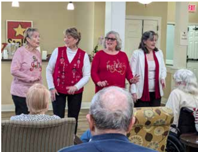
Stoney Brook of Belton Senior Living