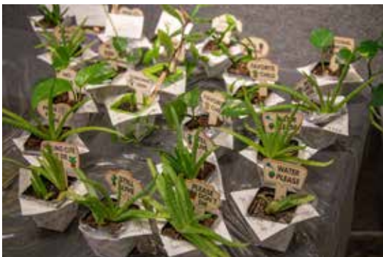
Small plants brought in large donations during our silent auction in September.

Fundraising: We’ve been successful at raising funds during silent and live auctions at our annual shows. At our September Amazon River-themed show, we added several tables of adoptable starter plants that members grew at home. Sheila Donahue folded hundreds of origami paper cache pots (think: takeout Chinese food) using music scores from old folios. Wooden stakes purchased online were an added touch – they had cute sayings preprinted on them such as “water me,” “favorite child,” “emotional support plant” and “I will survive.” They were a big hit along with other silent auction items. In fact, the plant idea was so well-received we decided to do it again at a one-day “vendor market” at an area senior living community and added homemade holiday baked goodies to the table.