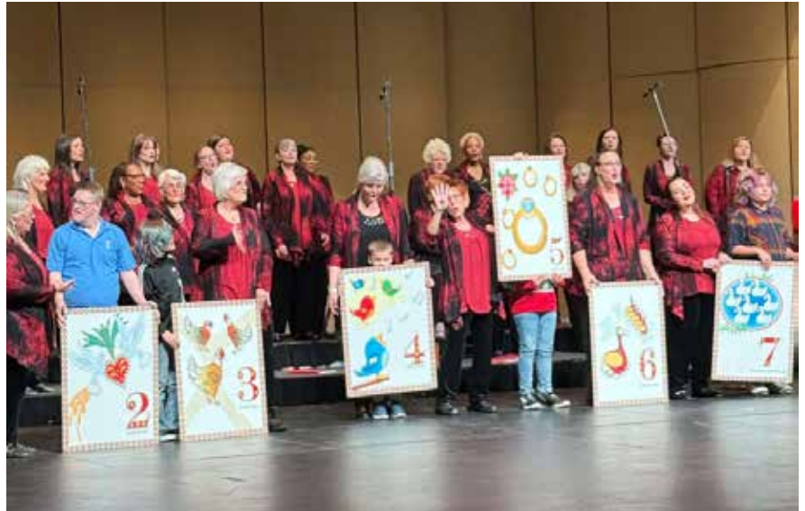
Irving Arts Center