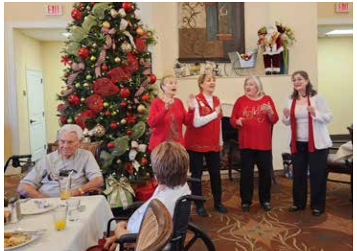
Singing at Adante Independent Living