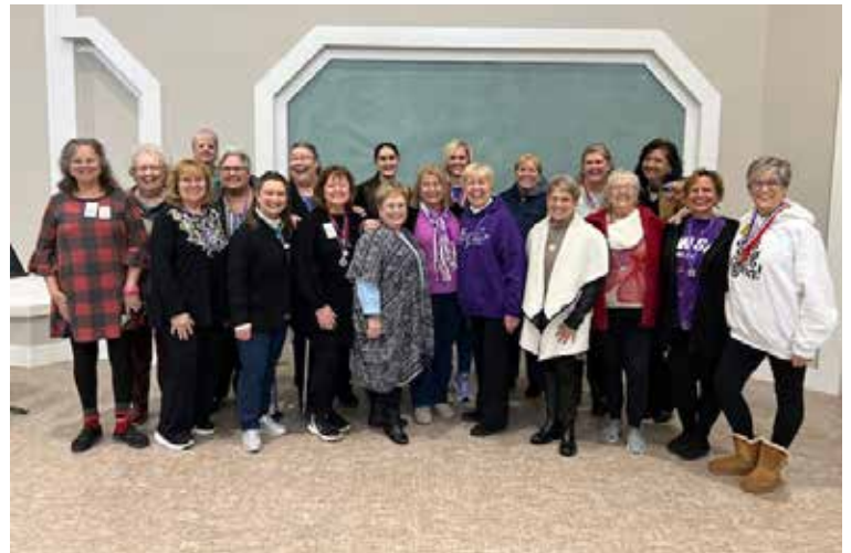
Recently some of our TWSC members attended the Region 10 Winter meeting