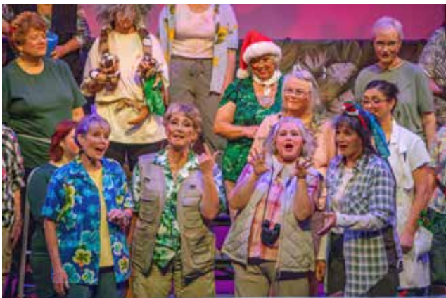
Performing on Chisholm Trail Chorus' chapter show in September, "An Amazon Adventure in 4-part Harmony."