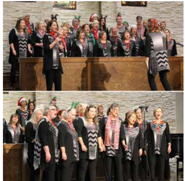
Highlights from our Holiday Concert and Market

In October, we held our inaugural Guest Night. This fun evening provided visitors with a warm introduction to barbershop and Houston Horizon, along with an opportunity for socializing afterward. Our guests had the opportunity to experience four-part harmony and join us in singing a few songs. Following the success of our October Guest Night, we organized a “New Year, New Hobby” Guest Night in January and were fortunate to welcome numerous visitors at both events. We were delighted to see so many enthusiastic faces eager to learn about the joys of barbershop singing.