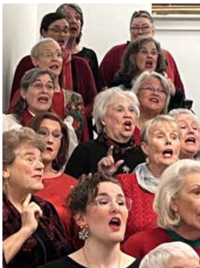
Indoor performance for the City of Belton, TX, tree lighting in December.

December: Chisholm Trail Chorus participated in a holiday market at a retirement community – read more under “fundraising” below. And because our annual chorus show was so early this year (September), we had plenty of opportunities to sing around our communities. First up was the city of Belton, TX, tree lighting event. It was moved indoors because of inclement weather to the county courthouse rotunda. They closed the event to the public, but the city's marketing team videotaped us