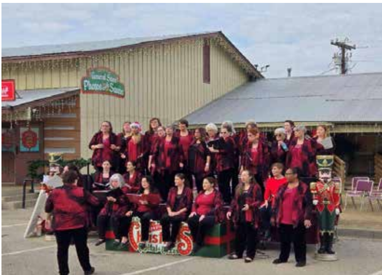
Grapevine Train Depot