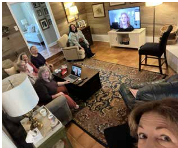
Region 10 Fall Fling Zoom

We're not letting any grass grow under our feet! We've already had two Adventure Trip performances in January and another booked for February. And look out New York, New York...here we come!