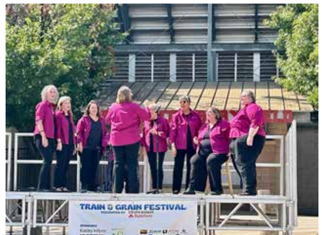
Singing at the Train & Grain festival