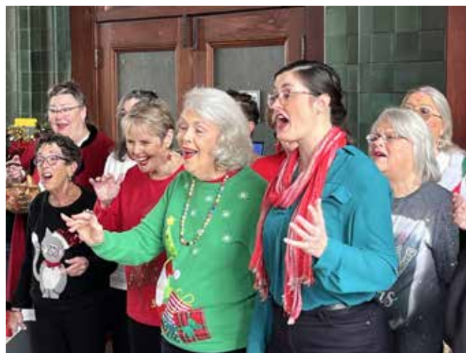
Entertaining visitors to the Santa Fe Depot Winter Wonderland event in December.

The Santa Fe Railroad Depot is in downtown Temple, TX, and that's where Santa Claus rode into town this year. Yes, he was standing on the front of the train, waving to adoring fans of all ages. Our chorus was there to greet him with several musical tunes, then everyone made their way inside the building that had been transformed into a Winter Wonderland. We were positioned at the front of the line to entertain parents and children with our holiday rep as they wound through a series of holiday-themed activity stations before landing in Santa's lap for photos.