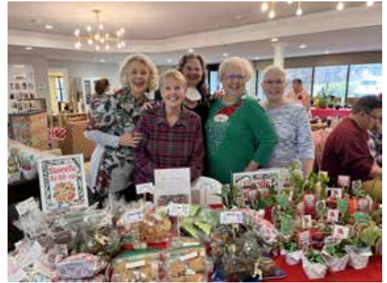
Holiday market fundraising booth included baked goods... and more plants!