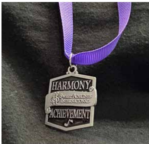
Up close and personal: Harmony Achievement medal from Kansas City International Competition