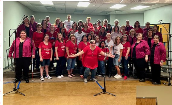
Note-ably North Texas Ice Cream Social