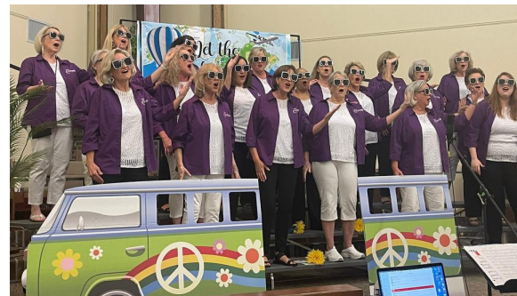
Adventure Trip Photos

Ahead for us this fall will be sharing our Adventure Trip during a couple more performances in the community, and then the Christmas season begins! Baton Rouge Chorus continues to move forward...No parking!