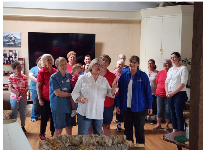
Hamilton, TX, Labor Day weekend performance