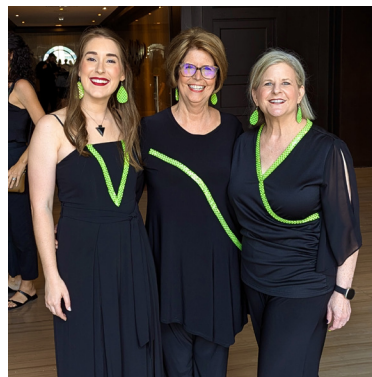
Our Space City Sound dual members. Congratulations on 10th place