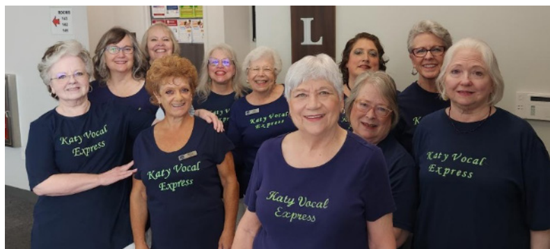
August 5 - KVE was invited to entertain the monthly AARP meeting held at the Steve Radack Community Center