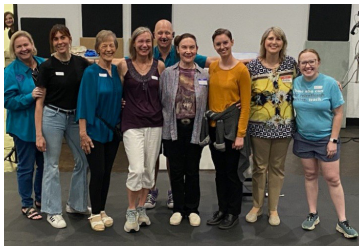
...And More Guests!