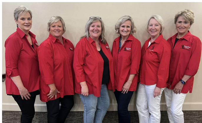
New Management Team Installed

In May we introduced our Adventure Trip series of rehearsals to entice guests to come along with us on our musical journey. It’s been great fun going on “vacay” with our sisters in song! Our next push is called Fall Into Colorful Harmonies. The OLLI Continuing Education program with LSU had us out for both their summer and fall kickoff rallies. It’s a great program for people ages 50+, and we’re happy to be a provider.