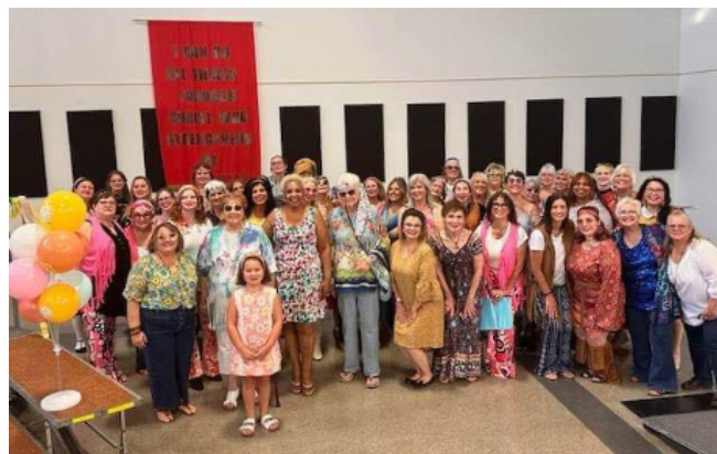
Beatles Friends & Family Showcase