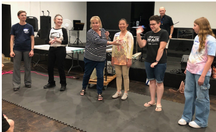
AMC Welcomes Guests