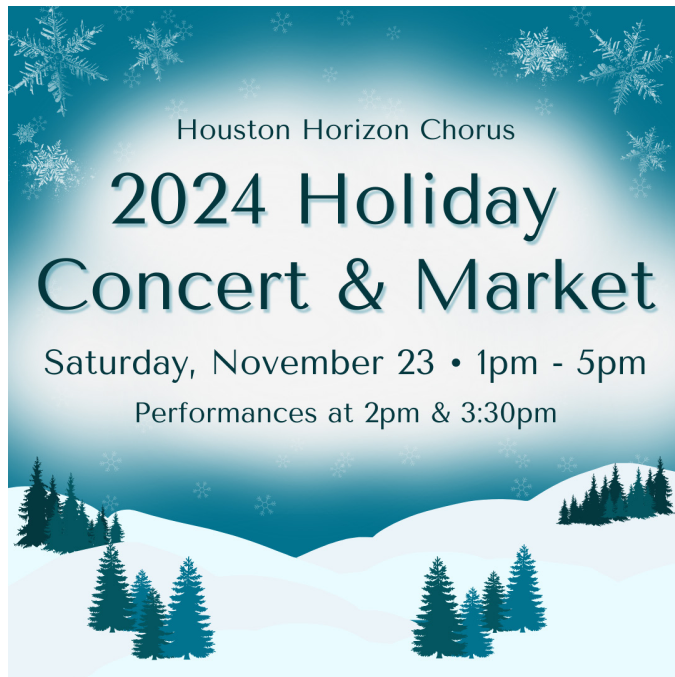
Join us for our Holiday Concert and Market