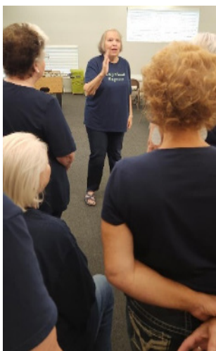
Warming up at St. Paul's Episcopal, September 5