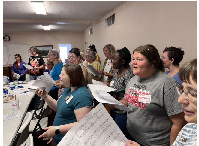
Jingle Summer Workshop singers