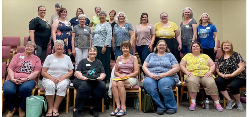
Tags and Treats Guest Night