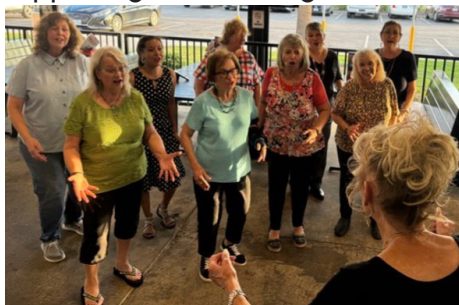
Celebrating Hispanic Heritage Month