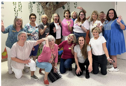
(Top) Summer Fling East participants (Bottom) Baton Rouge Chorus