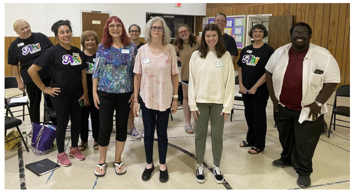
Several guests stopped by on our Open Rehearsal Night and we couldn't have been more happy to see them. Hopefully they'll stick around to keep helping us ring those chords!