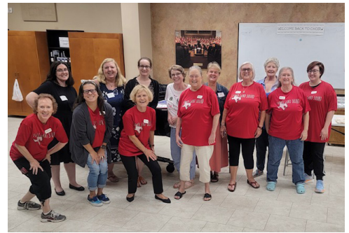
Some chorus members and new 'Elves'