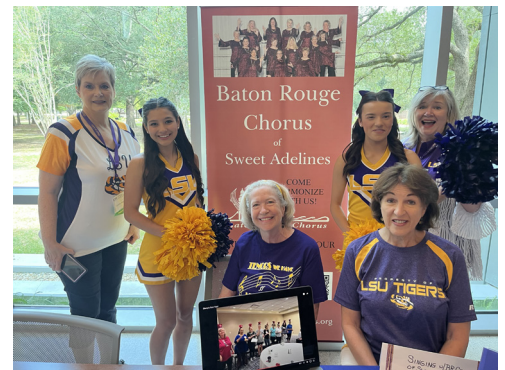
Dive Into Sweet Harmonies Classes for OLLI

Celebration was in order in August for the