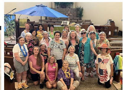
OLLI Tailgate event