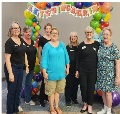
June Region 10 Workshop

In September KVE was invited to sing at The Gathering , a monthly event hosted by area churches for Alzheimer's patients and their caregivers/families. We all know music is a part of our souls and it was wonderful to see so many of the patients smiling and singing along on some of our songs! That is what it is all about!