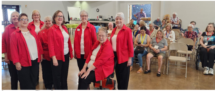
Singing at The Gathering