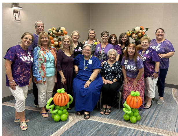
The Woodlands members at Fall Fling .

Submitted by Phyllis King, TIWT correspondent