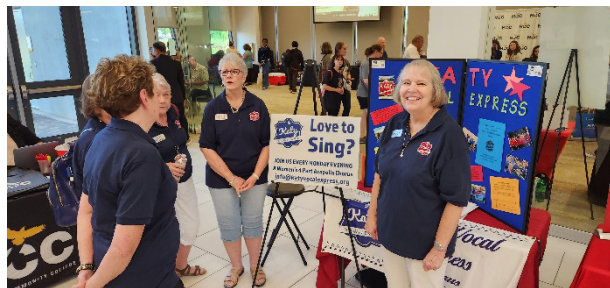
KVE booth at HCC