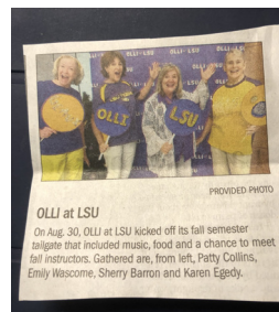
OLLI Tailgate photo in the Advocate newspaper