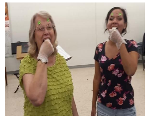
Check out the extra set of green eyes on the foreheads

We are definitely looking forward to leaving our mark at the competition. It’s going to be HOT, HOT, HOT but always with a touch of SPARKLE!!!!