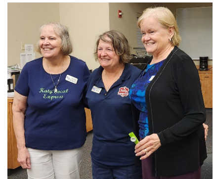
New Member installation