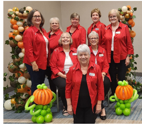
Fall Region 10 Workshop

Submitted by Adrienne Webster TIWT Correspondent