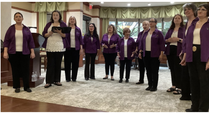
Many thanks to Brookdale Gaines Ranch, a local senior living center, for having us out to sing! We really enjoyed it!