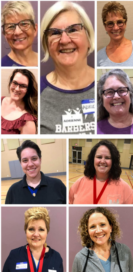
AMC's newest members