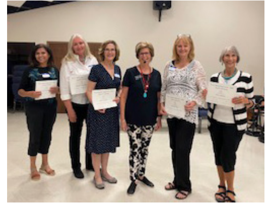
A Capella Experience visitors