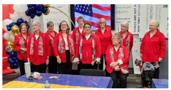
Singing for Veterans in November