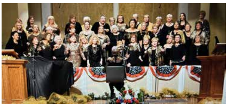
Dressy Black and Gold, TWSC performs in November

Thank you to all who supported our show efforts!