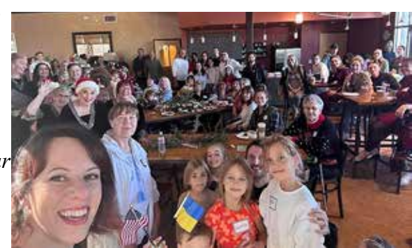
A very appreciative crowd of Ukrainian refugees

say it better than this quote from one refugee..."We're a small group of Ukrainians who came together in Austin due to the war which broke in our homeland, among other reasons. Some of us were drawn to Austin Ridge Bible Church because of its strong foundation for faith, especially during these challenging times. We were thrilled to be hosted by the church for a Christmas celebration, and it's even more special to have A Cappella Unlimited bless us with their lovely voices and the spirit of love and joy.