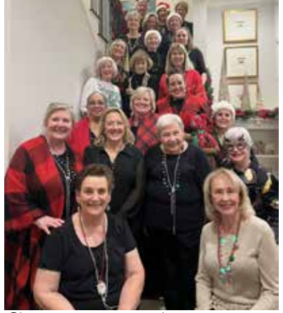
Christmas party time!