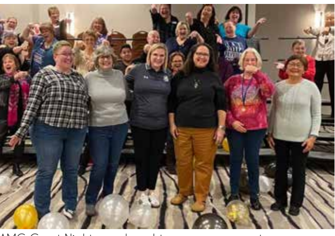
AMC Guest Nights produced ten awesome guests, three of whom are in the membership pipeline.