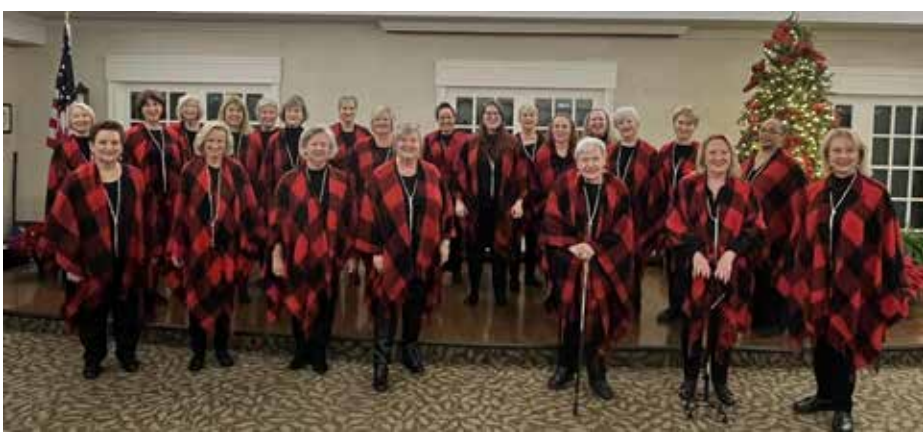
Christmas season performances; carols and jokes abound!