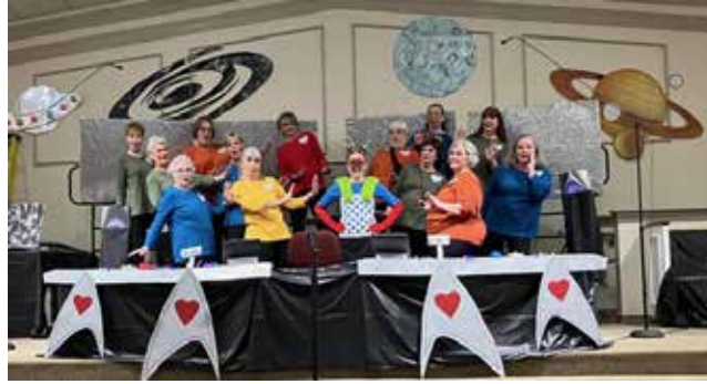
BLAST OFF! Fall Show: To Harmony and Beyond - Alien Visit

ing alien. We began working on Christmas music and, once again, invited the community to come learn a couple of Christmas songs to sing with us during any Christmas performances. To our delight, seven women joined us for singing in barbershop style.