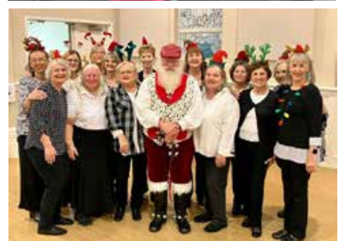
Two of our half-dozen Christmas performances