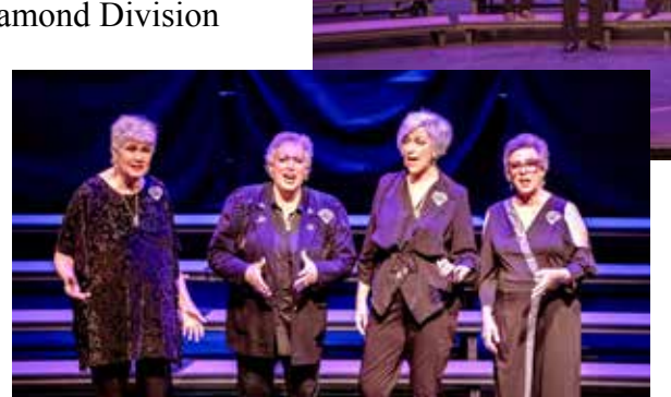
Madison Avenue Quartet, our guest performers

December brought only one rehearsal and the opportunity for chorus quartet "Just Us" to do some holiday sing outs.