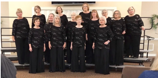
Friends and Family Dress Rehearsal in preparation for contest

We had one week's rest then on to our next performance at the Spring Fling at the local Farmer's Market. It's a great opportunity to let our community know "we are here" and find some prospects for the chorus.