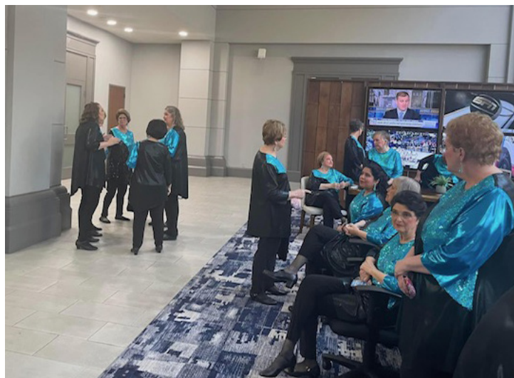
Houston Horizon waiting to take the stage.

What's next? Of course we will be participating in National BBS Harmony day, April 11! AND we will be hosting a 5th Tuesday Showcase - a free concert at our rehearsal hall on Tuesday, April 30, at St. Andrew Lutheran Church, 1353 Witte Rd in Houston. (We meet there every Tuesday night - come visit us anytime)!