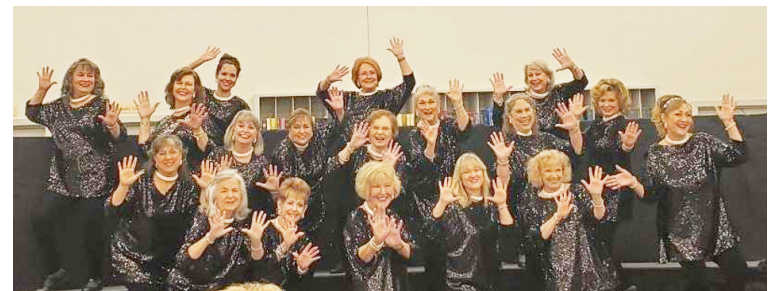
Sparkling City Chorus "Friends and Family Night 2024"