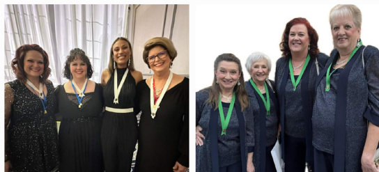
AMC's Quartet Medalists (clockwise) Saving Grace, Hot Note, New Edition and Essence