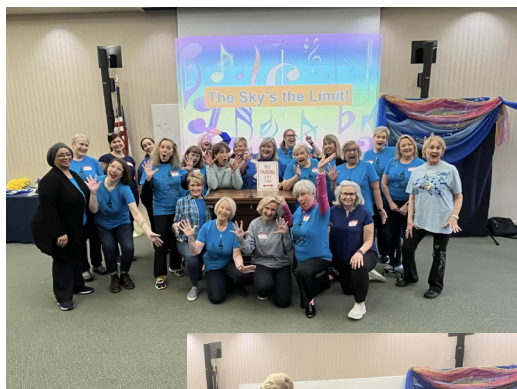
The Sky is the Limit at BR's retreat. Some of the talent hidden in the chorus.