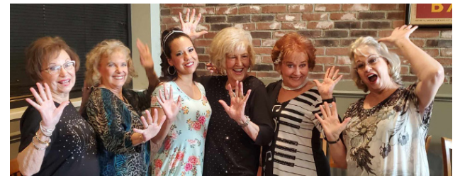
We want to thank our Music Team for their support.

After all the March Madness events and all the hard work comes celebration and recuperation. Hope you enjoy meeting our chorus sections celebrating and having a good time as depicted in these pictures.