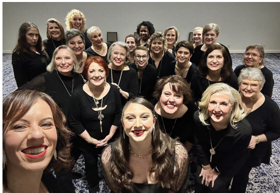
Au in Warm Up...ready to take the stage as Contestant No. 10

In the afternoon Au welcomed family members and friends to our send-off performance held in the atrium of the San Marcos Public Library. We were joined by Au's newest quartet 99 Problems . Contest came and went like Coyote chasing the Road Runner! Au was proud to finish with a 2nd in Division A and a 4th Overall. And we send our heart-felt congratulations to Crescent City with their 1st-Place Division A finish and 3rd Overall...plus their Most Improved and Audience Favorite awards. They were awesome!