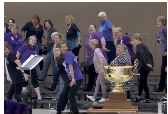
Taking an opportunity to perform in front of the gold winner's cup last rehearsal before contest

Submitted by Phyllis King, TWSC correspondent phylliskingt@comcast.net