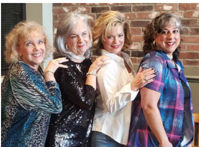
Well-blended Lead Section