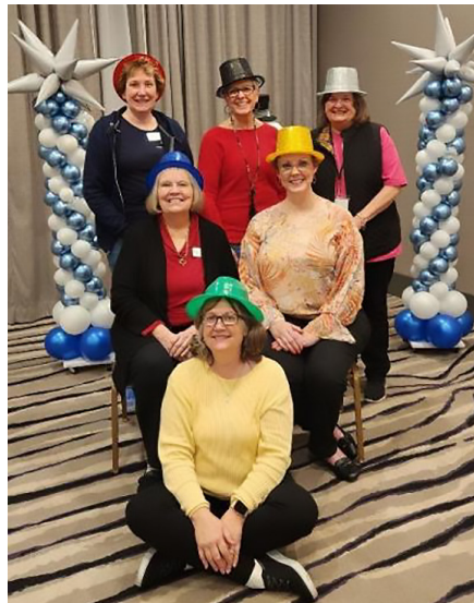
The many hats KVE members wear