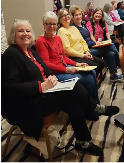
KVE members attended the January Region 10 winter workshop