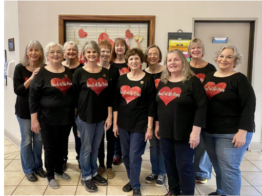
Heart of the Pines singing Valentines for the seniors.

February and March have flown by with so many activities and opportunities for HOP. The chorus decided to let the two quartets take Valentine's Day and do singing valentines in Nacogdoches and Lufkin. Both One AChord and Brick Street Harmony were busy running around town all day singing to unsuspecting sweethearts. The chorus visited 3 assisted living facilities the Saturday before Valentine's Day to share the love with some of our precious seniors.