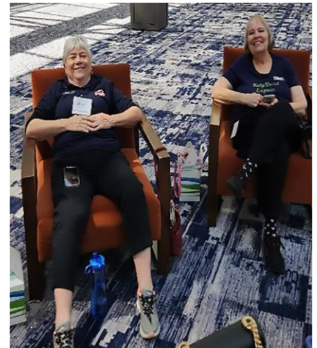
Relaxing before the music starts