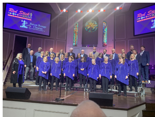
Acapella Spring Fling with Red Stick Sound