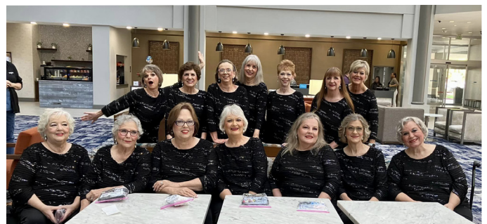
Ready for the Competition Stage!