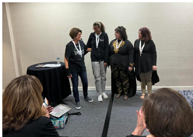
3rd place quartet winners, Essence entertains after their win.