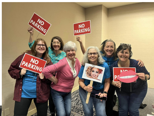
(Clockwise) BR received the Membership Growth Award, Contest first-timers, Chorus ready to sing.