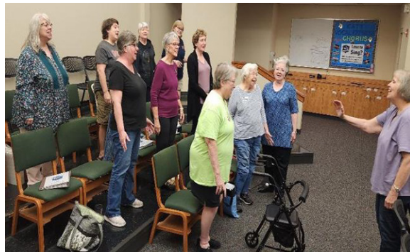
KVE at Contest