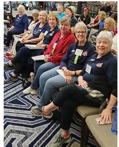
KVE loves the contest sounds