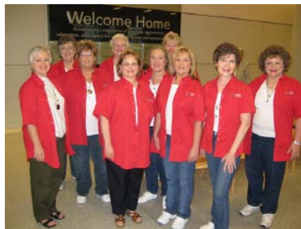
Ten Texas Harmony Chorus singers welcome home hundreds of U.S. soldiers at DFW International Airport.

July 2 and August 6 have become memorable days forever for Irving's Texas Harmony Chorus . In the hustle of those Monday mornings, while the